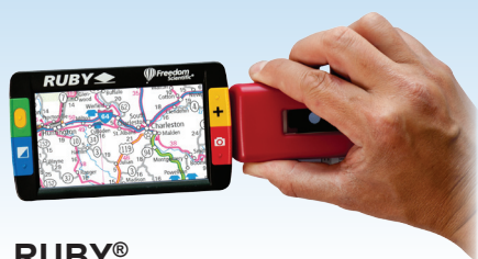
RUBY ® Pocket-Sized Handheld Video Magnifier for maximum portability

Visit us online at www.FreedomScientific.com to learn more about these and other innovative products from Freedom Scientific that make living with low vision easier.