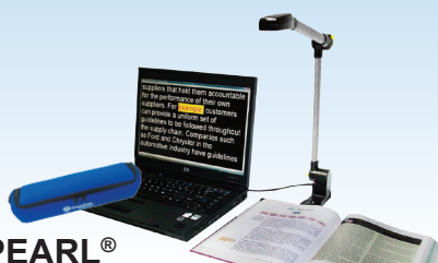
PEARL ® Portable Reading System for instant audible access to printed materials