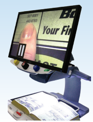
TOPAZ XL HD ® Desktop Video Magnifier with true HD and the widest available viewing area